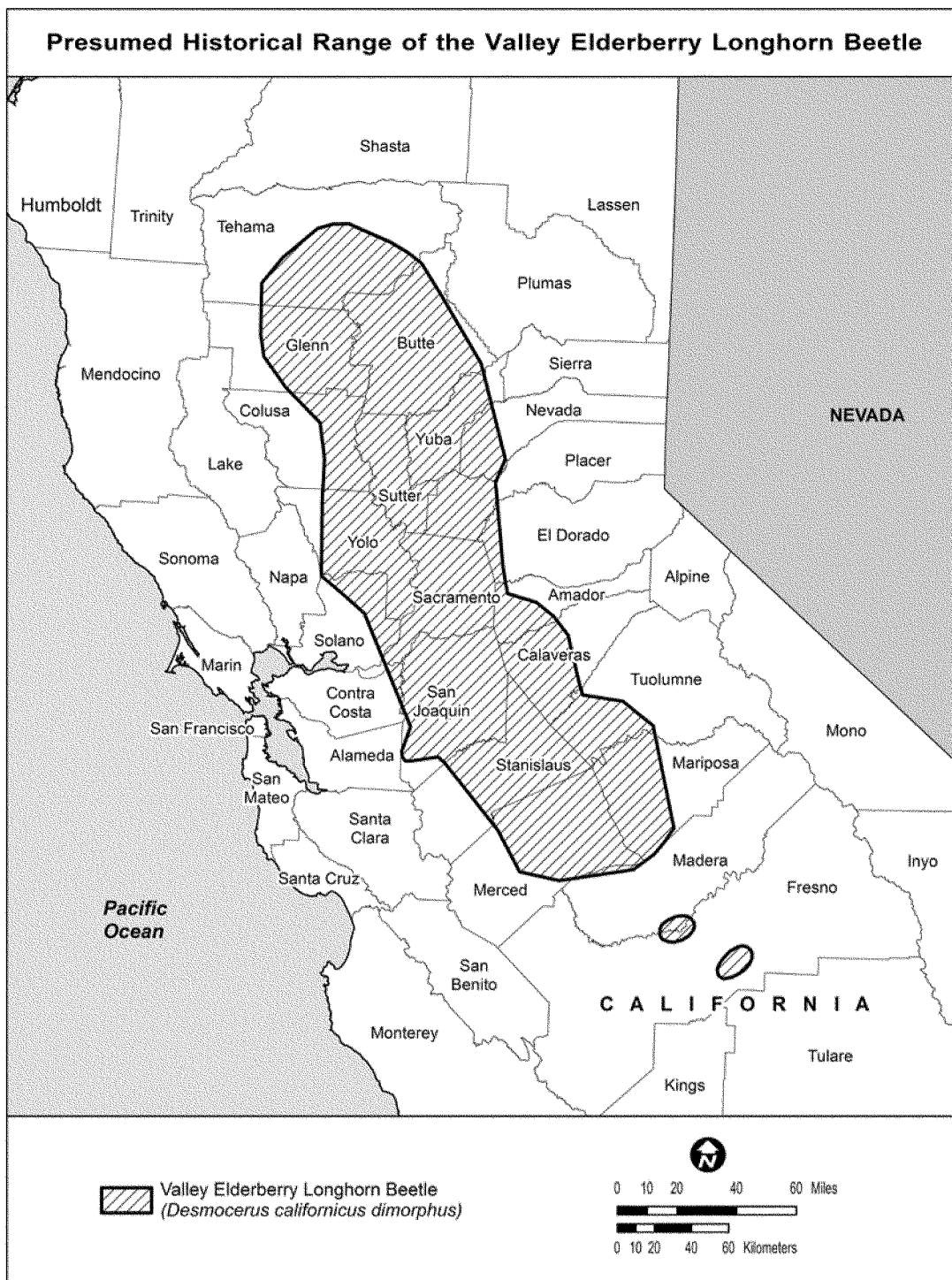
Figure 1. Presumed historical range of the valley elderberry longhorn beetle, California. Sources: Halstead and Oldham 1990, Chemsak 2005, Talley et al. 2006a, River Partners 2010, CNDDDB 2013, Arnold 2014a.