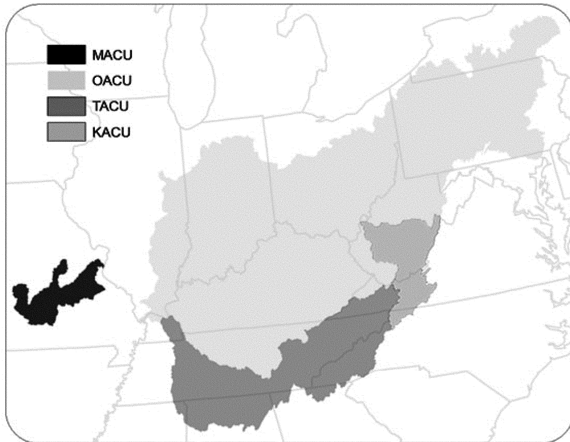
Figure 2. Evolutionary distinct lineages identified within the eastern hellbender subspecies by Hime et al. (2016, pp. 4–13). (1) Missouri (MACU), (2) Ohio River-Susquehanna River drainages (OACU), (3) Tennessee River drainage (TACU), and (4) Kanawha River drainage (KACU).

The Missouri DPS of eastern hellbender (or MACU) historically had five populations. One of the populations is considered functionally extirpated ( i.e. , the number of individuals remaining is so low that the population is no longer considered to be viable; while the four other populations are declining and not in healthy condition. As noted in our DPS analysis in the proposed rule, eastern hellbenders occupy small home ranges, and the populations within the Missouri DPS are disjoined from other populations of eastern hellbender by such a large geographic distance (200 river miles) that there is no feasible way other populations could act as a source for any populations within this DPS (84 FR 13232, April 4, 2019). The Missouri DPS's current condition is most strongly influenced by sedimentation, poor water quality, disease, habitat disturbance, small population size, and direct mortality. Additionally, collection and sale of eastern hellbenders continues to be a threat to the species. Augmentation