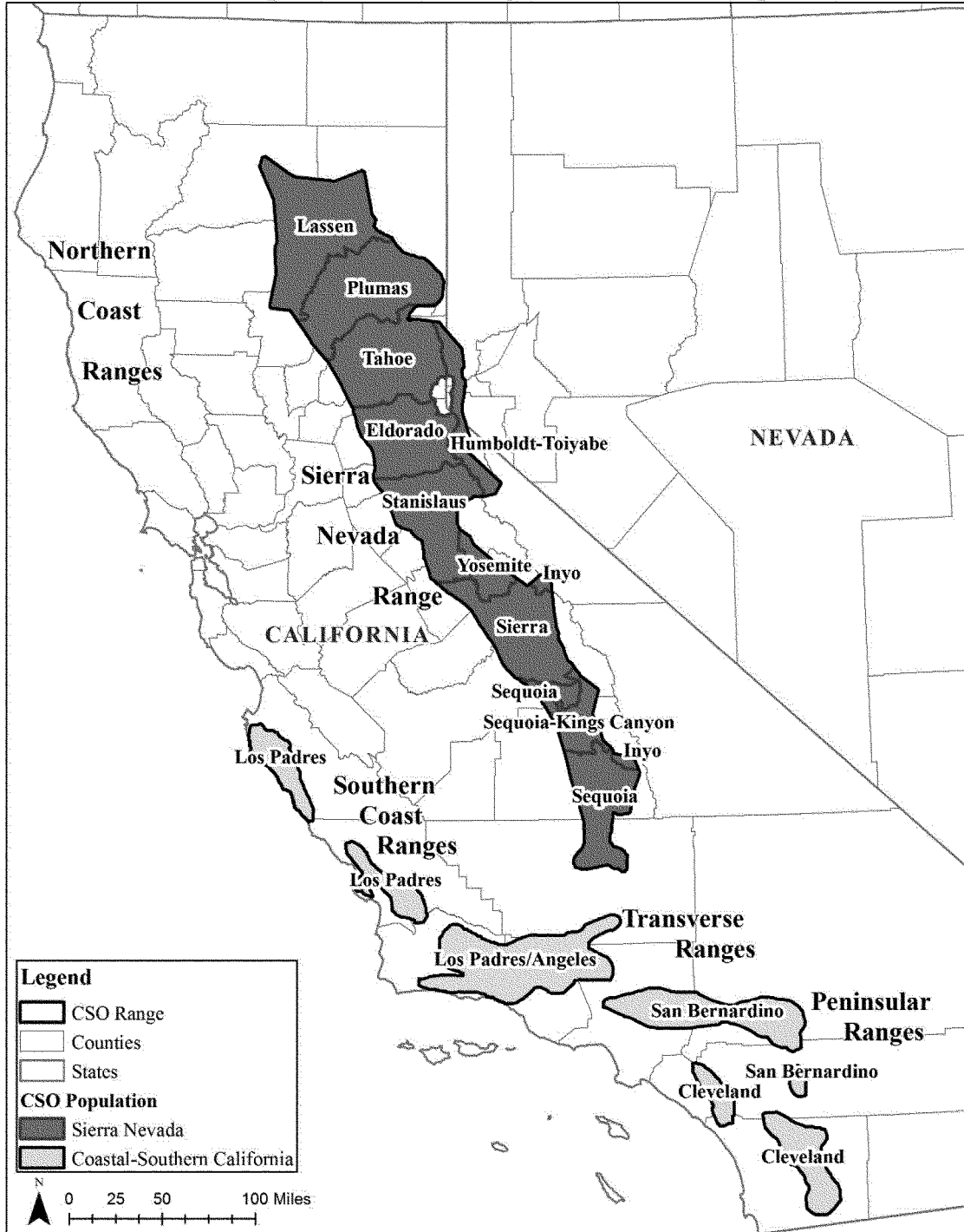
Figure 1—Populations and Analysis Units of the California Spotted Owl (CSO)